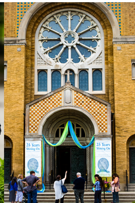
(left) 2019, Pietre Vive Formation Camp Zurich; (above) PV Service-Shrine of Our Lady of Pompeii, Chicago.