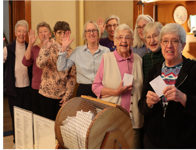
The Benedictine Sisters of Chicago held the Annual Cash Raffle drawing on June 8th, in lieu of the 26th Annual Testimonial Dinner which was cancelled with an abundance of caution as the Covid-19 cases continue to rise in Chicagoland. Congratulations to all of the winners! We are grateful for all who participated.