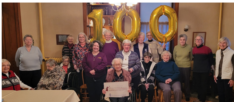
The Benedictine Sisters of Chicago, charter member of the St. Scholastica Federation marked 100 years with the Federation on Feb. 25, 2022.

T hanks to your prayers, donations, and well wishes, we are able not only to care for our elder Sisters' basic needs, but also provide a life of dignity that enriches their days in community. We are deeply grateful.