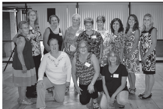
Alumnae of St. Scholastica Academy, Cañon City, and The Abbey gathered together in August for the 2014 All-Classes Alumnae Reunion Weekend. They enjoyed reconnecting and reminiscing at the Abbey Events Complex, with a special tour of the Abbey Winery.