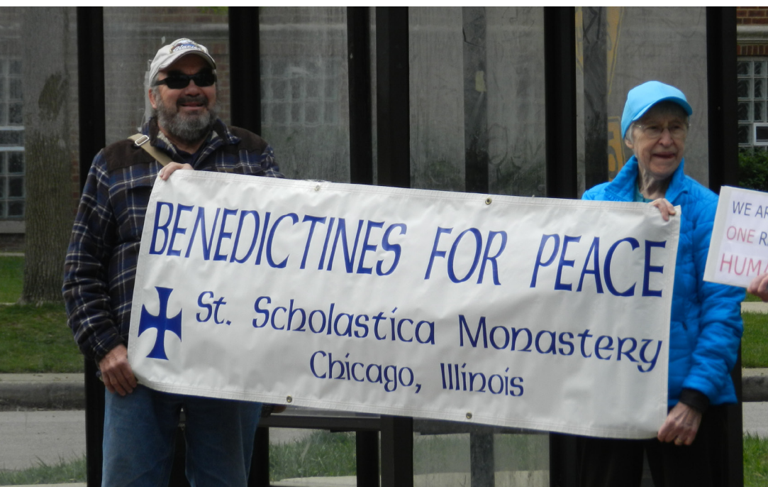
Oblates and Sisters came together on April 26th for the annual Stand Against Racism in Evanston, IL, part of a nationwide movement organized by the YWCA.