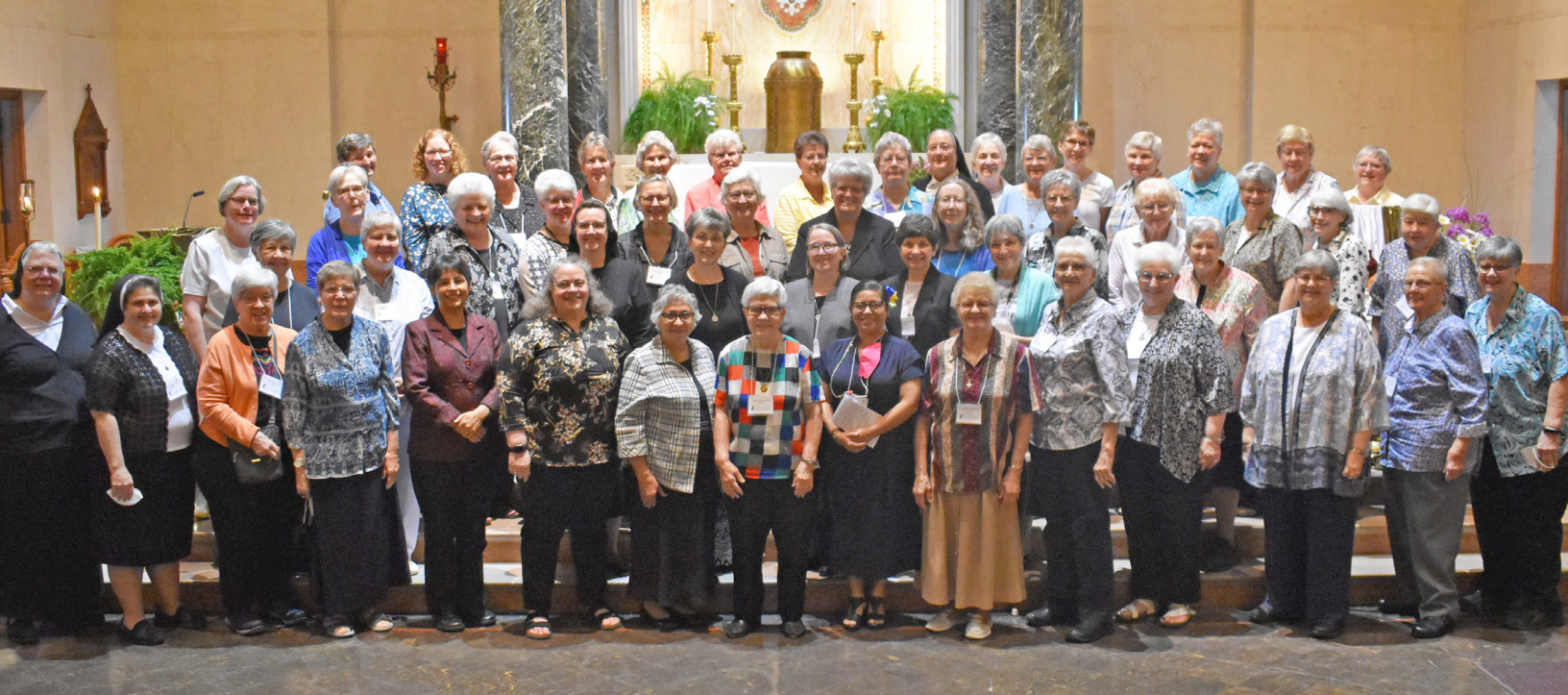
Group photo of Benedictine delegates at the Centennial Celebration in June 2022.