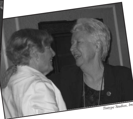
Tintype Studios, Inc.