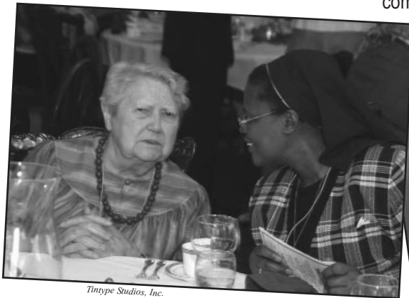
Tintype Studios, Inc.